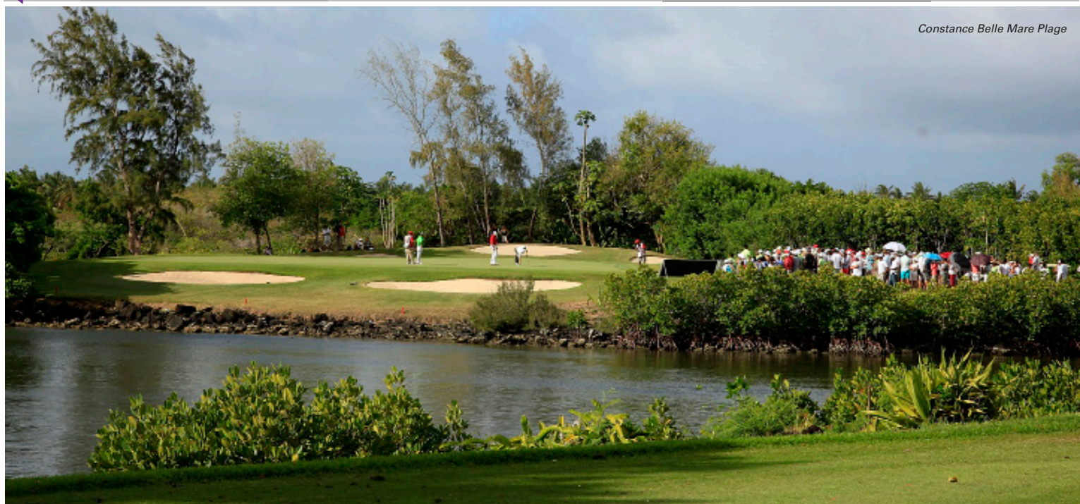
Constance Belle Mare Plage